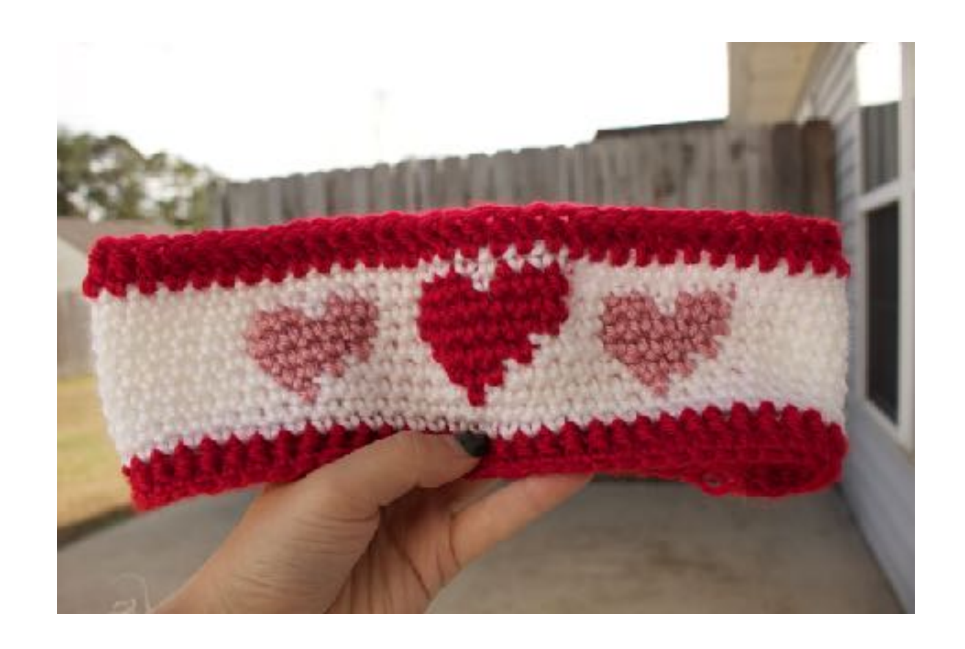
(Duch love, Queen of ħearts